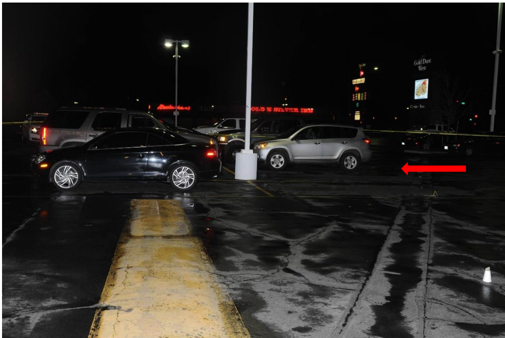
(Gold Dust West Casino southwest parking lot, taken from a south facing view of the parking space where Raymond Salaiz' vehicle was parked during contact with police. This photograph is taken after the crash occurred so the white Dodge Avenger is not depicted in the parking space.)

Directly across from the Casino on 5 th Street are the Plaza Apartments located at 777 W. 5 th Street. The driveway for the apartment complex exits to the south on 5 th Street and is directly across from the northwest entry/exit driveway of the Gold Dust West.