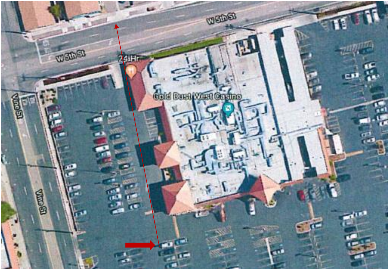
(This satellite photograph shows the parking space that Raymond Salaiz' vehicle would have been parked during police contact and the direction of travel, north through the Gold Dust West parking lot, and eventual crash site after the shooting.)

in which Salaiz parked the white Dodge Avenger is an east-west facing space. The front of the white Dodge Avenger faced east with a vehicle parked directly in front of it; the second scene was the crash site which was located in the driveway of the Plaza Apartments directly across from the north 5 th Street exit of the Gold Dust West Casino.