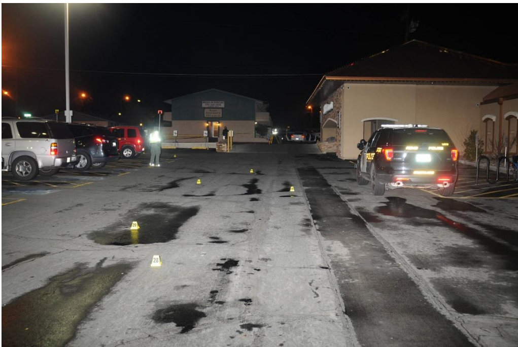
(Gold Dust West Casino west parking lot, with a north facing view of the Plaza Apartments. This photograph depicts the route in which Salaiz drove the vehicle to the crash site.)