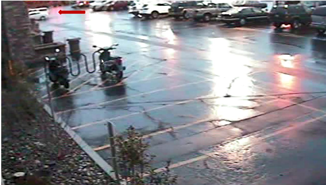
(Still photo from Gold Dust West surveillance camera 6313 showing where Salaiz parked the white Dodge Avenger just south of the building on the west side of the casino (red arrow points toward vehicle) at approximately 4:50 p.m. The west entrance can be seen on the left side of the photo near the stone pillar.)

A review of the entirety of the surveillance video demonstrated that Salaiz arrived at the Gold Dust West at approximately 4:50 p.m. in the white Dodge Avenger and parked in the first space just south of the casino.